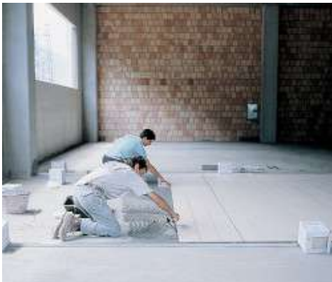
Installation of porcelain tiles in an industrial environment