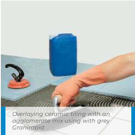
Overlaying ceramic tiling with an agglomerate mix using with grey Granirapid