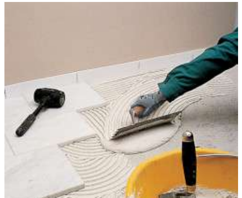
Installation of white Carrara marble with white Granirapid