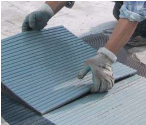
Overlaying rubber flooring on cement with Granirapid