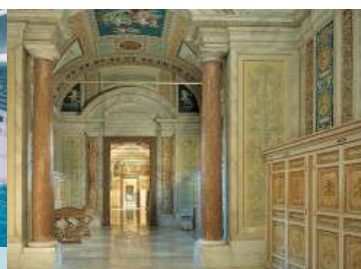
Sistine Corridors - Vaticano - Rome