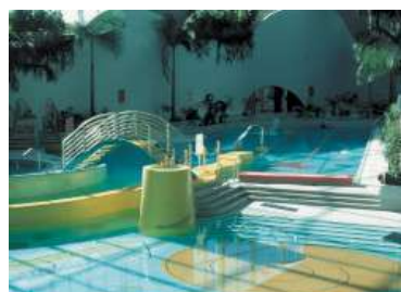
An example of mosaic and klinker installed in a swimming pool