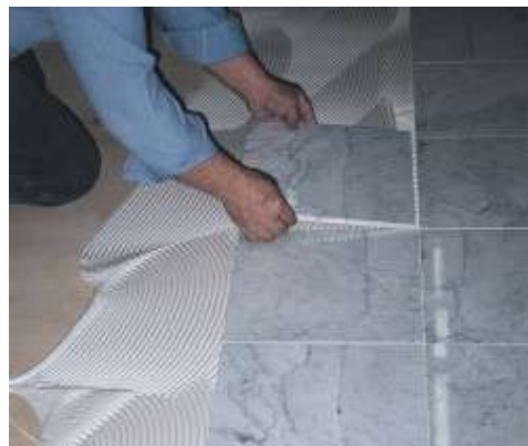
Installing Carrara marble on wooden substrate with White Keralastic