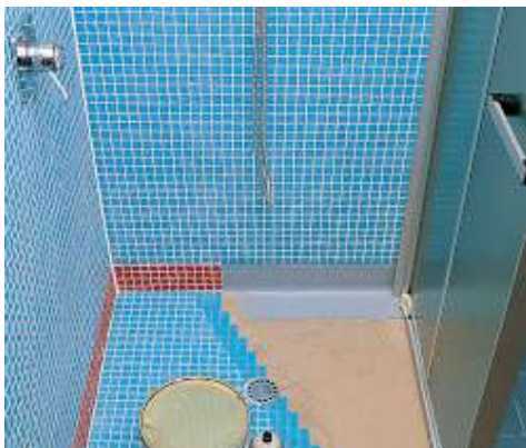
Waterproofing and laying in a prefabricated shower unit