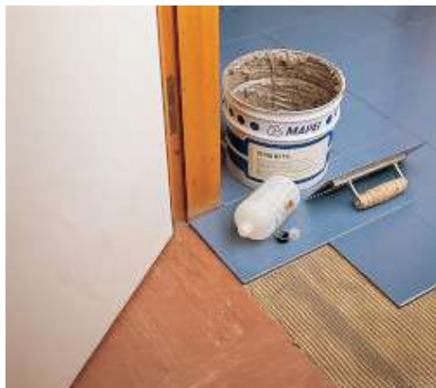
Laying on an old PVC floor