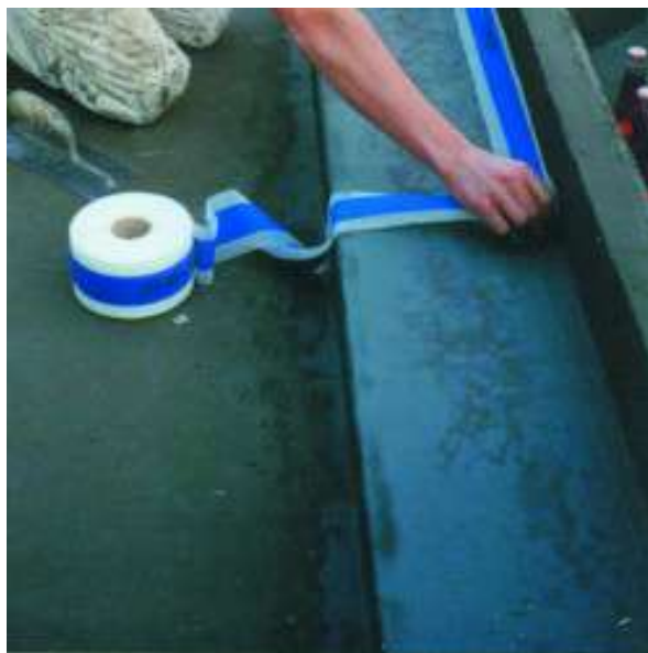
An example of Mapeband waterproofing a corner between the bottom and a side of a bath tub