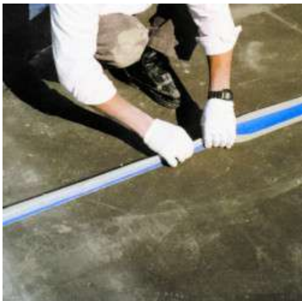
An example of waterproofing an expansion joint on a terrace