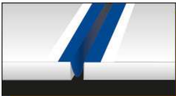
Ω positioning of Mapeband inside an expansion joint