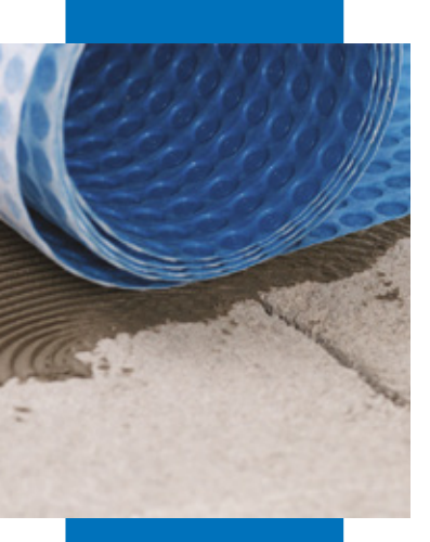
Laying of Mapeguard UM 35