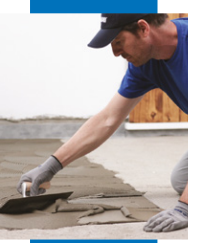
Application of adhesive with a n. 5 notched trowel