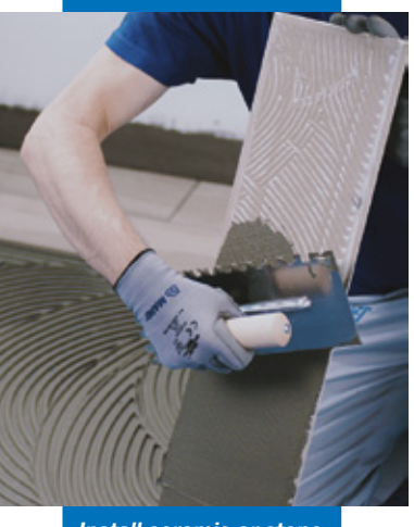
Install ceramic or stone tiles with a suitable MAPEI adhesive of at least C2 class