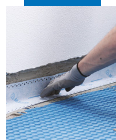
Perimetral waterproofing with Mapeband Easy, bonded with Mapeguard WP Adhesive