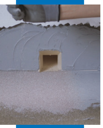
Waterproof drains with drain front

All relevant references for the product are available upon request and from www.mapei.com