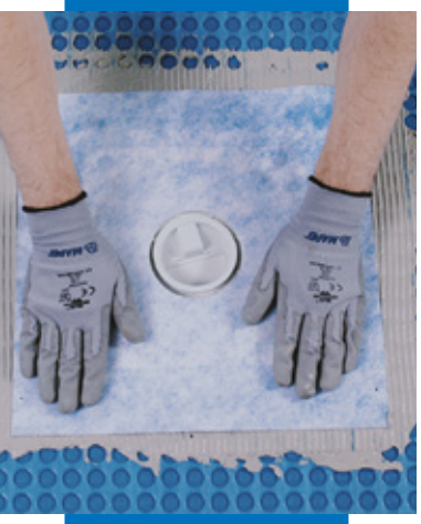
Waterproof drains with Drain Vertical/Drain