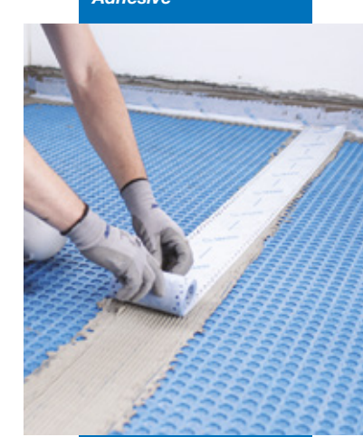
Waterproofing of joints between the sheets with Mapeband Easy, bonded with Mapeguard WP Adhesive