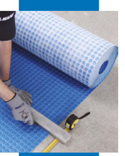
Cutting Mapeguard UM 35