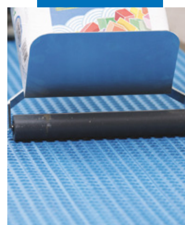
Pressing Mapeguard UM 35