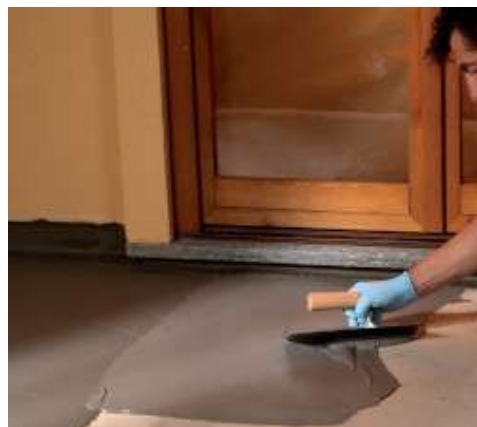
Waterproofing of terraces by trowel