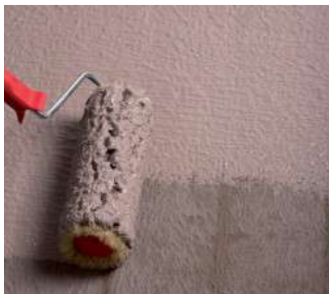
Waterproofing of details by roller