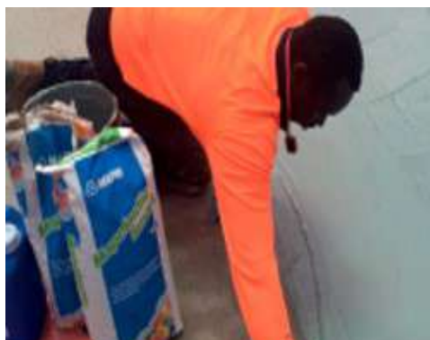
Installing Mapelastic Smart in the 50 metre pool at the Adelaide Aquatic Centre

ANY ALTERATION TO THE WORDING OR REQUIREMENTS CONTAINED OR DERIVED FROM THIS TDS EXCLUDES THE RESPONSIBILITY OF MAPEI.