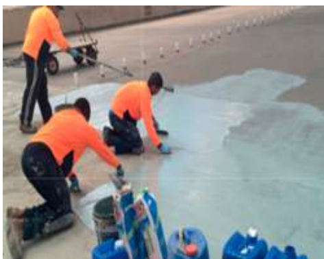
Installing pool tiles over Mapelastic Smart waterproofing membrane