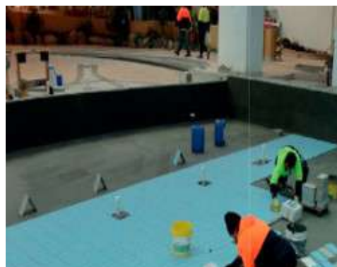
Installing pool tiles over Mapelastic Smart waterproofing membrane