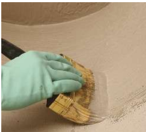
Waterproofing of details by brush