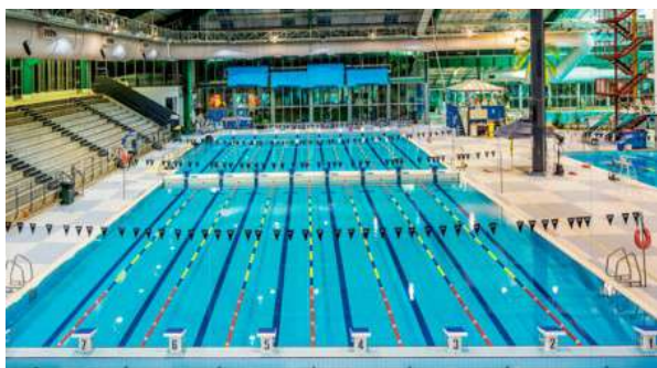
Completed 50 m pool at the Adelaide Aquatic Centre