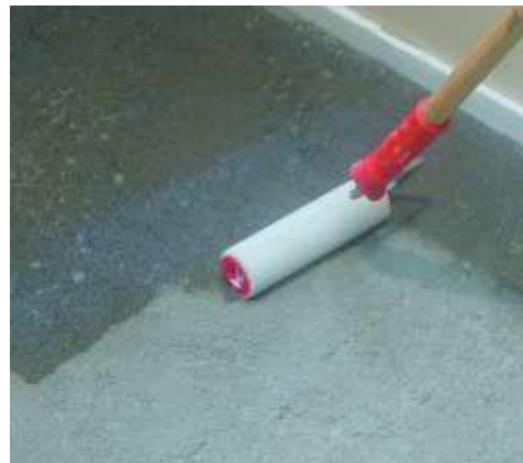
Applying Primer G with a roller