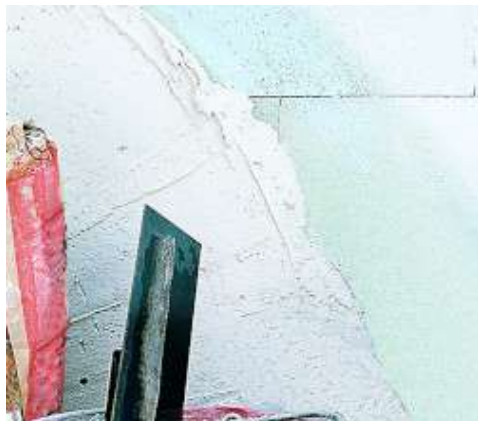
Use as a primer for gypsum plasters