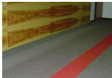
Example of Primer G applied before spreading on Ultraplan Eco and Rollcoll adhesive, used to bond carpet in a hotel room - Villa Hotel Castellani - Austria