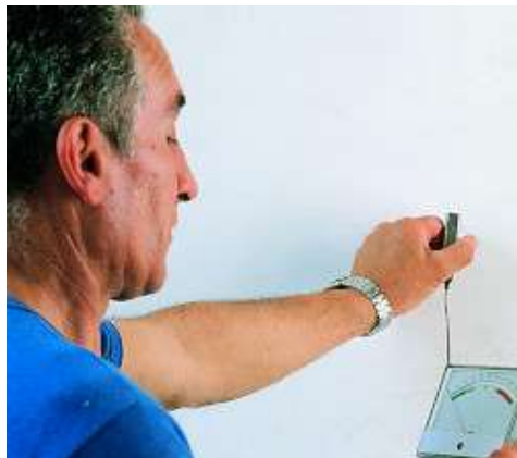
Checking gypsum plaster humidity