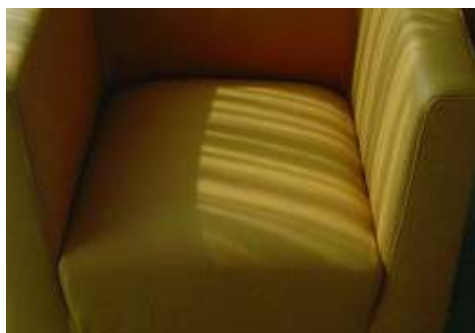
Example of Primer G applied before spreading on Ultraplan Eco and Rollcoll adhesive, used to bond carpet in a hotel room - Villa Hotel Castellani - Austria